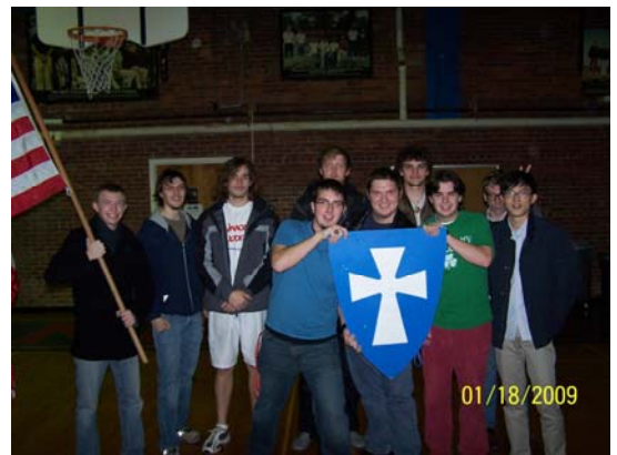
Class of '09 at Rush Night

For further information please check the Chi Chapter Alumni website. http://www.hanoversigs.org