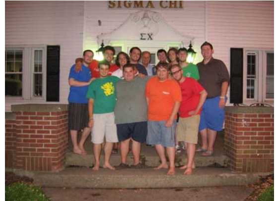
Brothers Before '09 Initiation